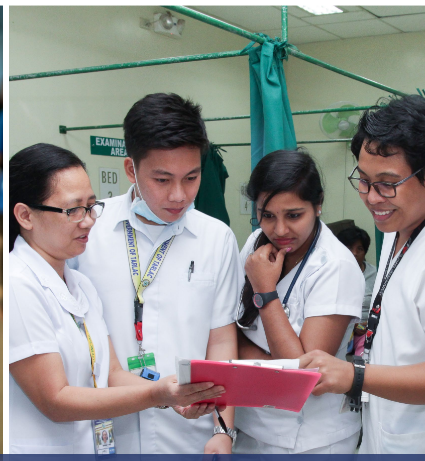
Six Years in 60 Minutes: Learning from the HRH2030 Program